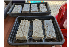
... and here are they, waiting to dry in the sun