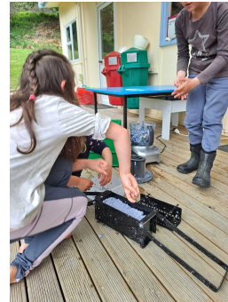
Forming the bricks