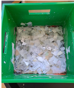
The shredded, soaked paper