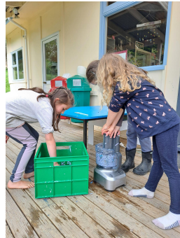
Making pulp is a real teamwork